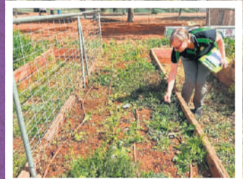
Edible Garden Winner: South Kalgoorlie Primary School