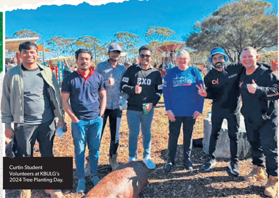
Curtin Student Volunteers at KBULG's 2024 Tree Planting Day.

KBULG is very grateful for its strong, ongoing engagement with a large group of dedicated Curtin student volunteers. Curtin student volunteers from international backgrounds volunteer across the community, proactively building connections while bringing diversity and enthusiasm to many events and projects.