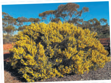
Goldfields Tan Wattle ( Acacia hemiteles ) in bloom at Karlkurla Bushland Park.

On the 1st of September we celebrated National Wattle Day. While the Golden Wattle was officially proclaimed Australia's national floral emblem in 1988, wattles have held deep cultural and traditional use significance for Indigenous Australians for much longer.