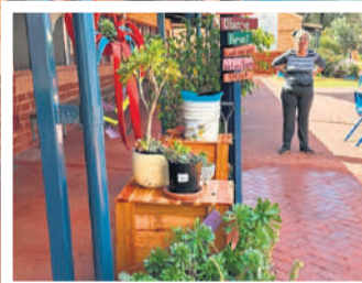
School Winner: O'Connor Primary School