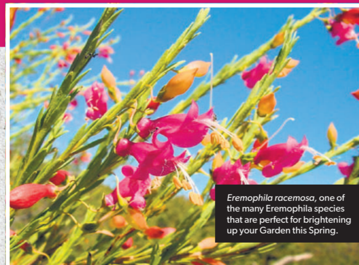
Eremophila racemosa, one of the many Eremophila species that are perfect for brightening up your Garden this Spring.

Mulch made from large pieces is more effective at allowing water through and retaining it in the soil. Spread a layer of 8-10 cm thickness over your garden beds.