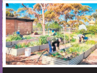
Community Organisation Winner: Kalgoorlie-Boulder Community Garden